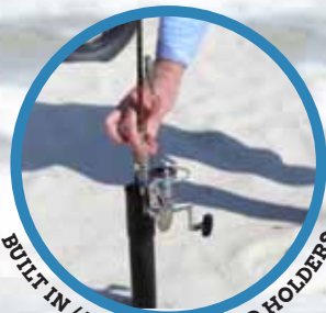
BUILT IN / REMOVABLE ROD HOLDERS