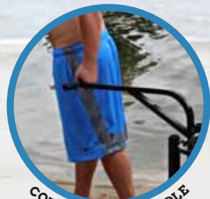
COMFORT GRIP HANDLE