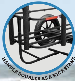
HANDLE DOUBLES AS A KICKSTAND