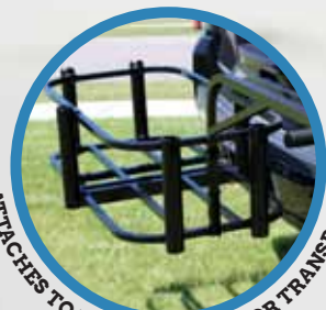
ATTACHES TO YOUR VEHICLE FOR TRANSPORT